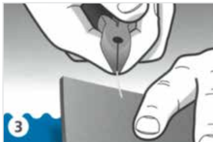
Gently pull the pin out using pliers.