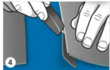
Carefully cut the top cover.