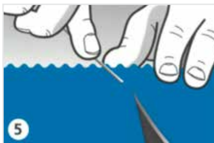
Press the ends back together firmly.