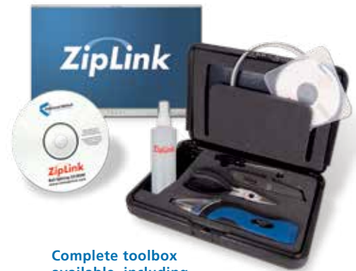
Complete toolbox available, including instruction CD

ZipLink® provides long life and flexibility for multiple applications. The belts can easily and quickly be changed without accruing significant downtime or expensive overtime. After converting to ZipLink®, time and personnel required to change belts may be reduced by more than half.