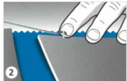
Pop the pin out at 1.5 cm from the edge.