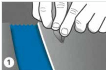
Score the back and lubricate the pin.