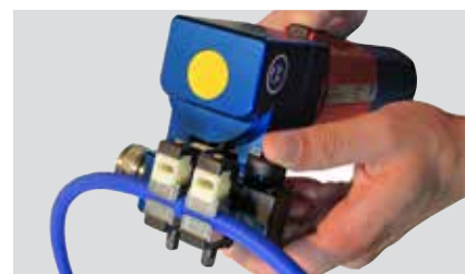
Friction welding machine