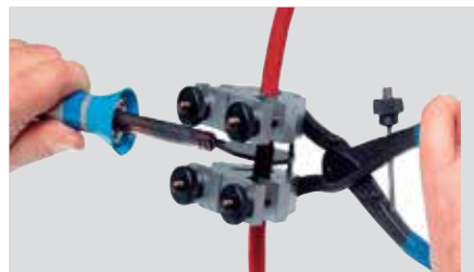
Welding paddle manual tool