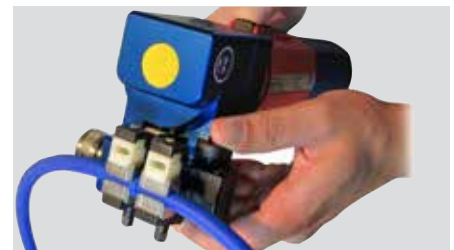
Friction welding machine