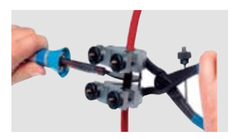
Welding paddle manual tool