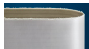
Leading competitor's equivalent belt