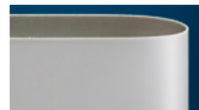
Ropanyl Premium Plus Belt

Fraying / durability test results obtained after identical laboratory tests: