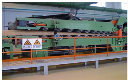
A prepress machine in operation