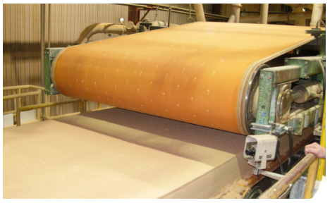
A seamless endless woven prepress belt in