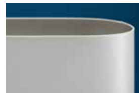
Ammeraal Beltech non-fray belt