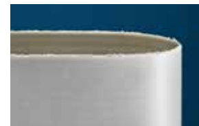
Leading competitor's equivalent belt

*results obtained after identical laboratory tests