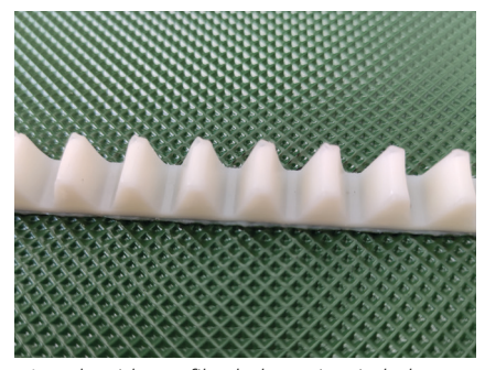
Amtel guide profiles help maintain belt alignment

Contrary to popular belief, sometimes the presence of a longitudinal joint can favor the centering of the belts, especially when they work on 'square conveyors'. Thanks to the longitudinal splices, we can meet width requests of up to 5 meters while maintaining the same original characteristics of the belt.