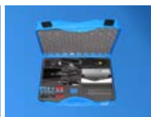
RAPPLON® QuickSplice tool QSP 105 RAPPLON® QuickSplice tool fitting set