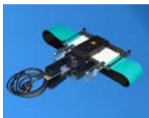
RAPPLON® QuickSplice tool QSP 105

Please read the splicing instructions carefully.