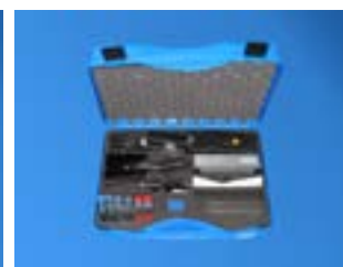
RAPPLON® QuickSplice tool fitting set