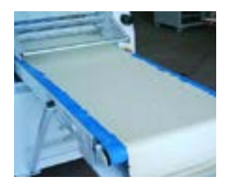
New Ammeraal Beltech light blue belt