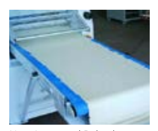
New Ammeraal Beltech light blue belt