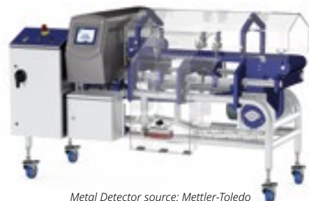
Metal Detector