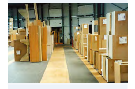
Our uni JCB Modular Belts can carry the load – and your warehouse staff – safely and reliably.

Strength, durability and safety are of paramount concern with floor-level warehouse conveyors, particularly when it may be necessary for employees to step on, off and in between moving belts.