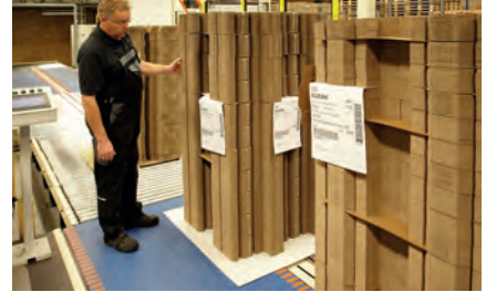
uni Modular Belts offer clean flat surfaces for improved product quality and staff safety.

ni Modular Belts offer clean flat surfaces for