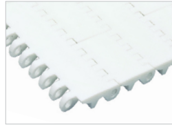
uni MPB Closed Same/Next day service 10 m 2 of belt | 20 sprockets