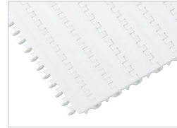
uni S-MPB Closed Same/Next day service 10 m 2 of belt | 20 sprockets