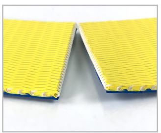
Innovation and Service in Belting