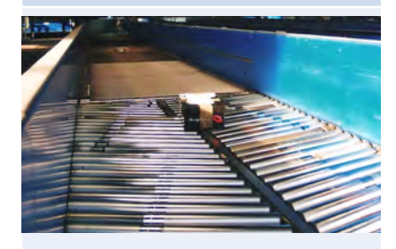
Unloading – Automatic Parcel Singulator

An Automatic Parcel Singulator (APS) transforms a simple bulk-flow system into an ergonomically and operationally efficient system, giving you downstream and upstream control of parcel flow. However, to achieve this efficiency, your APS will require a wide variety of belts working in sync together.